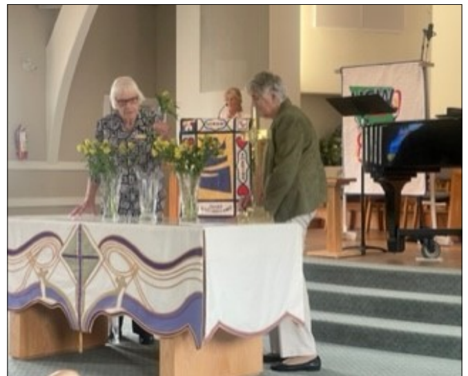
Remembering our lost members in Fraser Region, at Fraser UCW AGM at Peninsula United Church, which four of our members attended.